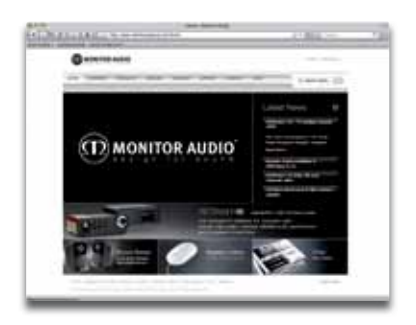
To discover how we reach music lovers all over the world, please visit: